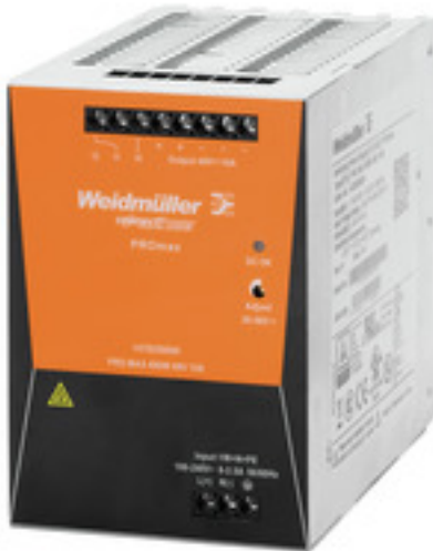
Similar to illustration

Weidmüller Interface GmbH & Co. KG Klingenbergstraße 26 D-32758 Detmold Germany Fon: +49 5231 14-0 Fax: +49 5231 14-292083 www.weidmueller.com